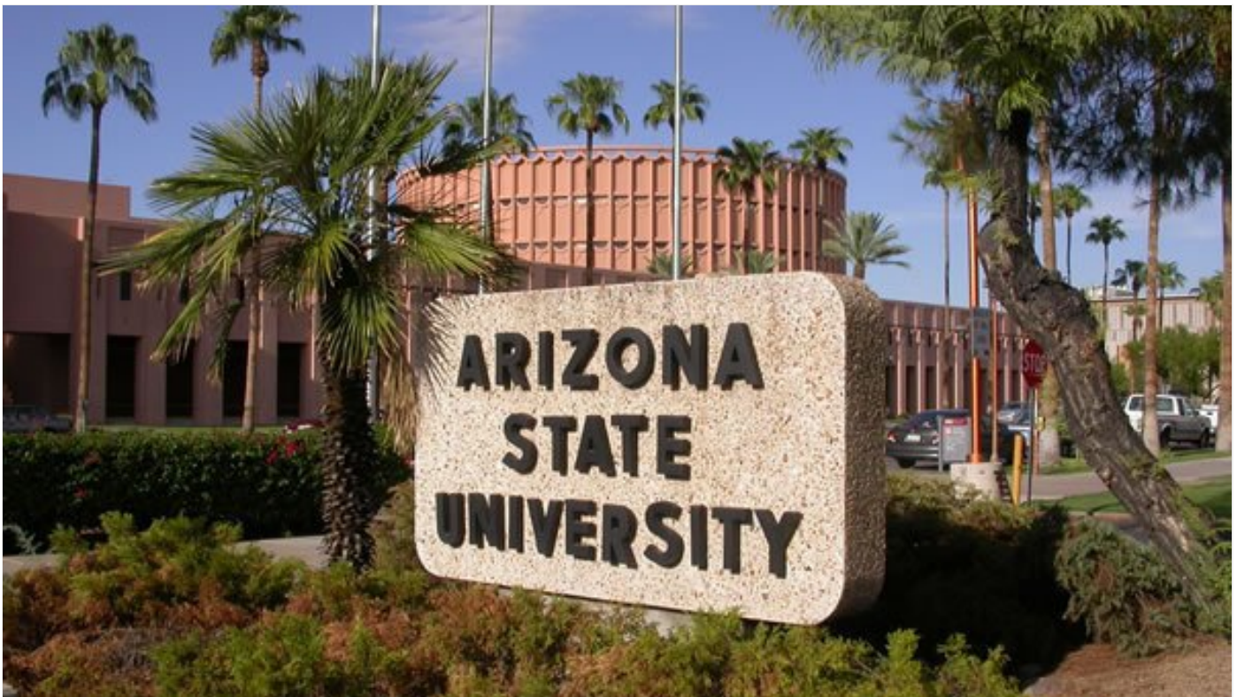
Arizona State University campus in Tempe