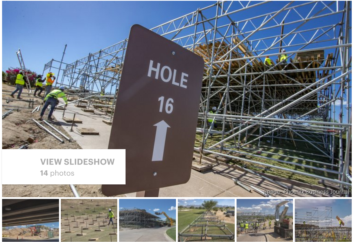
While the 2024 WM Phoenix Open is a little more than four months away, the annual construction projects for "The People's Open" are already underway,

Scottsdale ranked No. 1 in public courses per 100,000 residents (9.47); No. 1 in private courses per 100,000 residents (12.36); and No. 1 in PGA golf coaches per 100,000 residents (7.41). Scottsdale was No. 2 overall in number of golf resorts (8); and tied at No. 2 for total number of amateur golf competitions and tournaments (16).